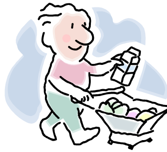
After Christmas is the best time to shop

LINENS: White sales are in January, so you'll be able to find non-holiday-related merchandise such as sheets, bedding, place mats, pillows, curtains and towels.